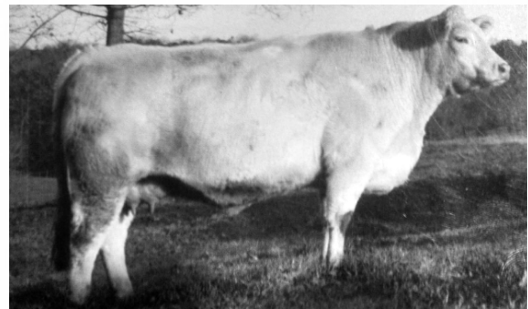
OHF Tradition E919