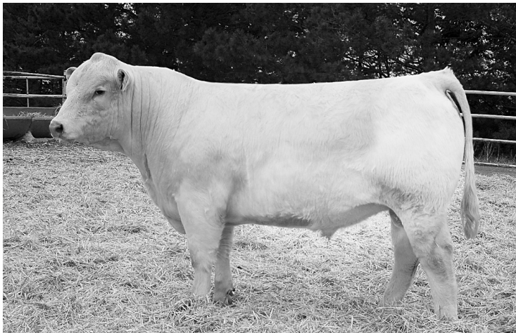
HCR ANSWER 2042