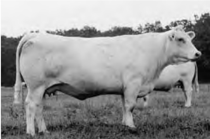
ABC Latora Lazodoble