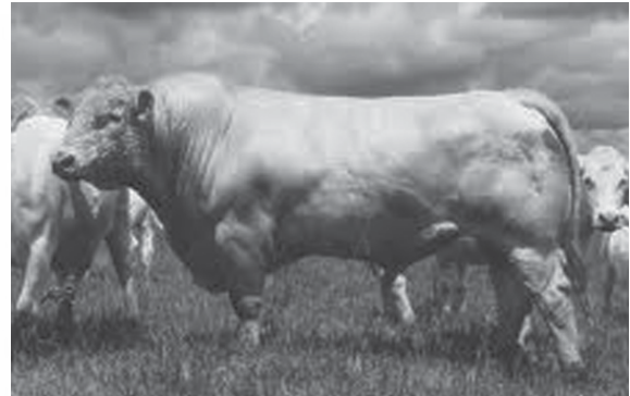
WCR Sir Fa Mac 2244